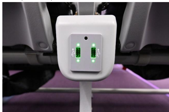
USB port for charging