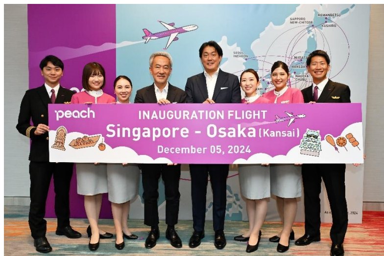
Press conference announcing the launch of the service in Singapore